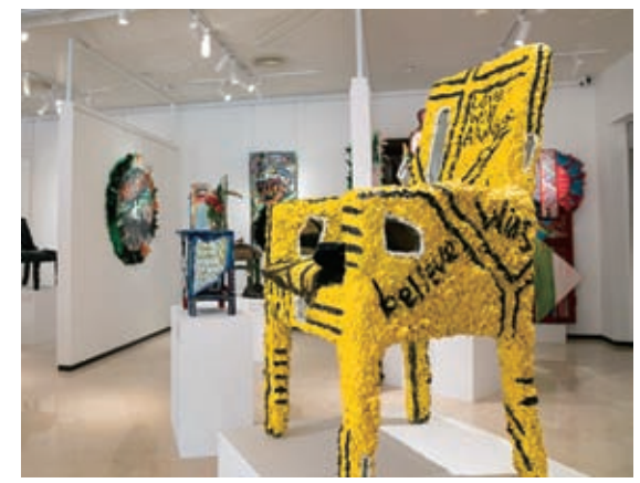
Sculptural "THRONES" are a standing topic of Redic's works. They are collected from different corners of the city. — Zhou Shengjie

"I wanted to salvage some of the history, some of essence of neighborhoods, and then from a bigger standpoint, reinterpret them in art with the themes that I imbue in my mind," he said.