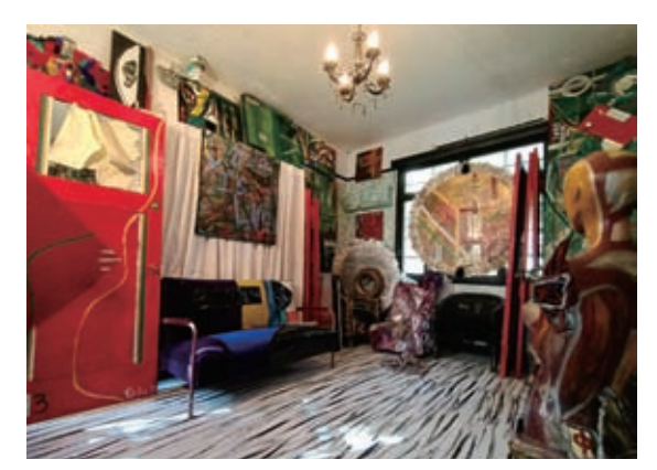
Vintage and modern converge in Redic's living room. — Zhou Shengjie