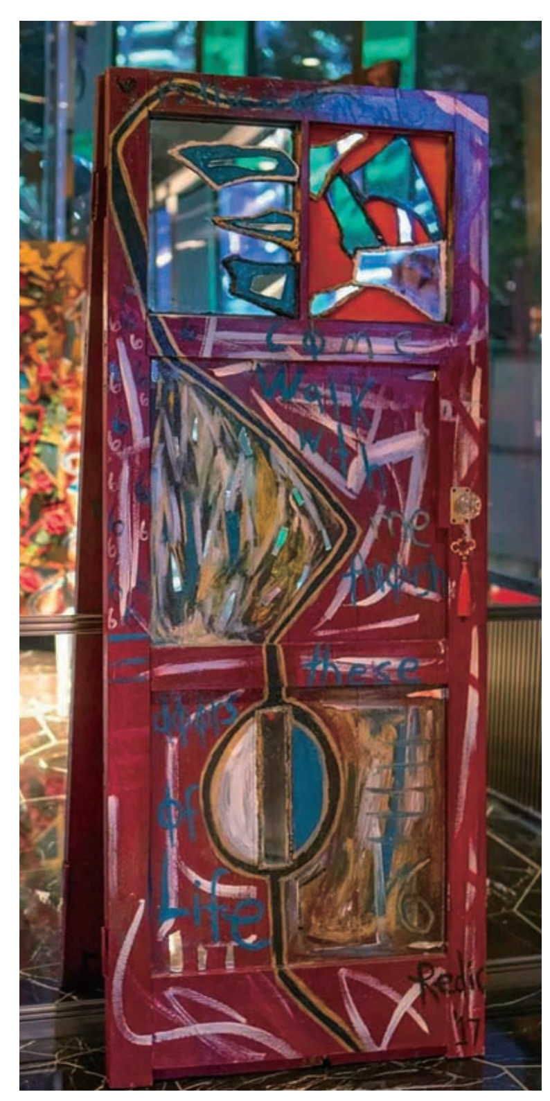
The "Doors of Shanghai/Doors of Life" series is based on doors Redic collected from different corners of the city. — Kirill Buhtiyaro

"I need to leave the door open," he said enigmatically.