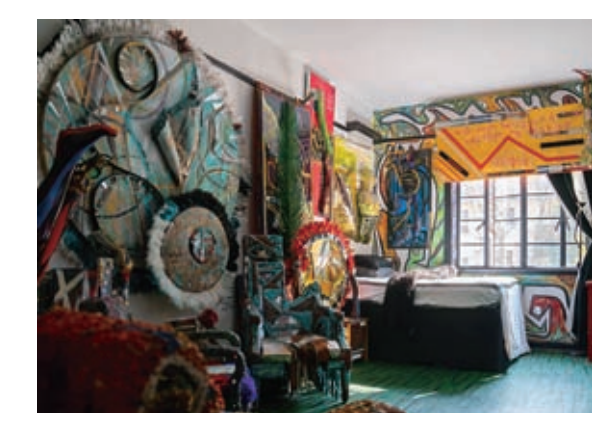
The artist has drawn inspiration from discarded items retrieved from all corners of Shanghai. — Zhou Shengjie